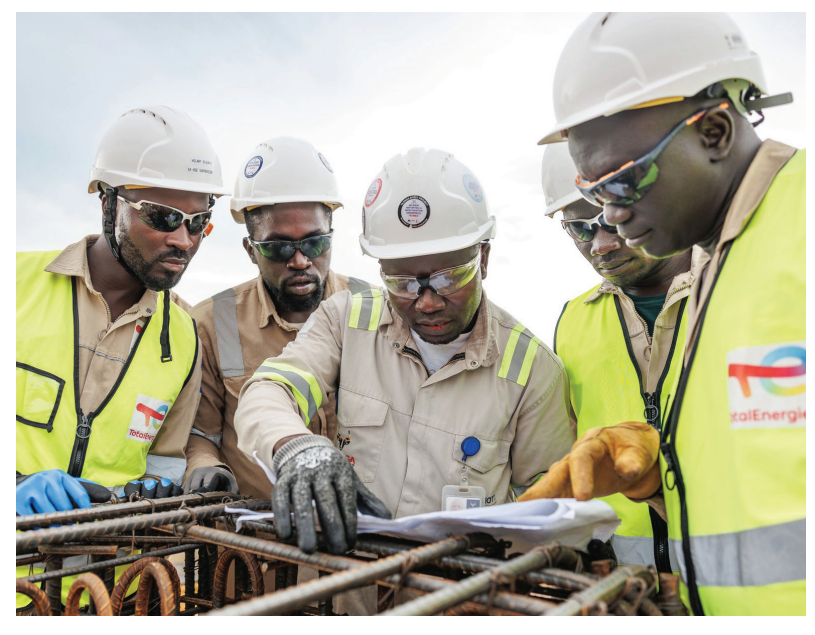
Ugandans working on the Tilenga project implemented by TotalEnergies EP Uganda.

Transitioning from strategic planning to practical implementation, government is advancing four major oil and gas projects, namely: the Tilenga and Kingfisher projects in the upstream ($6-8b), the East African Crude Oil Pipeline ($5b) and