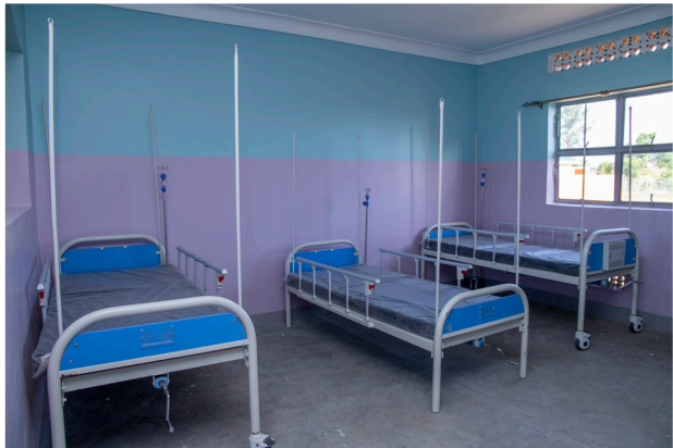
A snapshot of the revamped Avogera Health Centre III Out-patient facility recently revamped by TotalEnergies EP Uganda