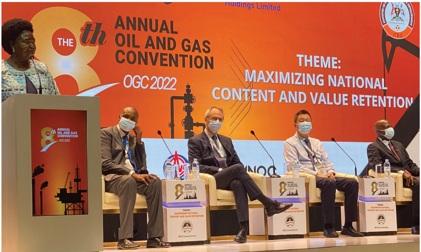
Honourable Ruth Nankabirwa, Minister of Energy and Mineral Development (L), addresses guests during the 2022 UCMP Convention, looking on is Philippe Groueix TotalEnergies EP Uganda GM and other sector dignitaries Minister of Energy and Mineral Development (L), addresses guests during the 2022 UCMP Convention, looking on is Philippe Groueix TotalEnergies EP Uganda GM and other sector dignitaries

April 12th and 13th 2022 saw over 800 licensees, government entities, contractors, bankers, subcontractors and several other stake holders in the oil and gas sector convene at the Kampala Serena Hotel in Kampala for the 8th Annual Oil and Gas convention organised by Uganda Chamber of Mines and Petroleum, (UCMP).