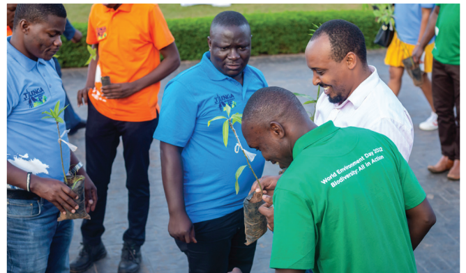
TotalEnergies EP Uganda staff receive tree seedlings during the Kampala World Environment Day celebrations held at Mestil Hotel