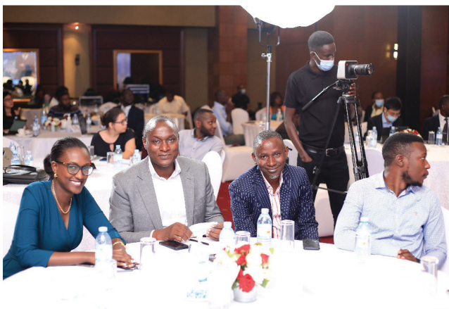
Snapshot of participants at the TotalEnergies EP Uganda Q2 2022 National Supplier Development Forum