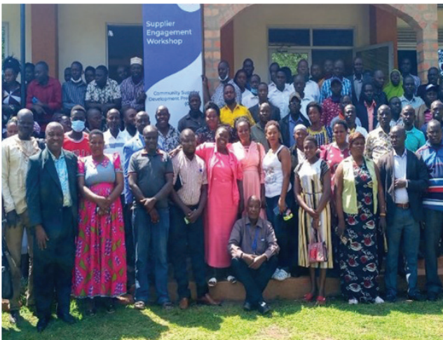
Participants of the Masindi 1st Quarterly Supplier Workshop