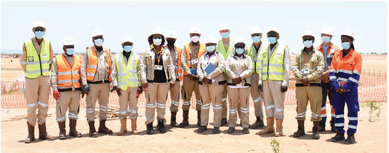
TotalEnergies EP Uganda staff and Joint Venture Partners pose with media at Tilenga Industrial Area during a media site visit.

TotalEnergies EP Uganda, together with Joint Venture Partners CNOOC, UNOC and PAU together with Ministry of Energy and Mineral Development, set out to host the media at the Tilenga, Kingfisher, and Kabaale Airport among other areas of operation.