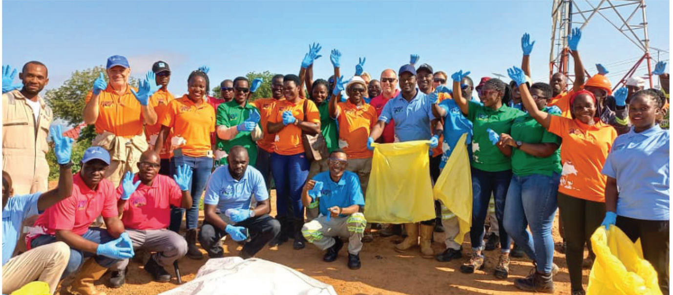
TotalEnergies EP Uganda Tilenga project site staff pose after World Environment Day celebrations that included ridding Wanseko town of waste.

TotalEnergies EP Uganda site team celebrated World Environment Day (WED) at Wanseko Town Council, while in Kampala. One TotalEnergies commemorated the celebrations at Mestil Hotel in Kampala. TEPU staff at site were joined by different Tilenga Project Contractors like Mota-Engil, McDermott International Ltd, and Pearl Engineers, to mention but a few.