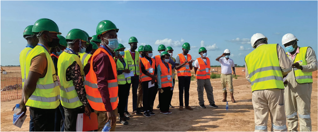
University students at TotalEnergies EP Uganda Tilenga project sites during a field visit

After a proposal from the Student Community of Makerere University Petroleum and Geology Society (MPGS) to partner with TotalEnergies EP Uganda in having Petroleum Engineering students acquaint themselves with knowledge about the Albertine Region, Makerere University Students, lecturers, together with students from other Universities, participated in a 2-day visit to the Tilenga Project Area from May 26th -27th 2022.