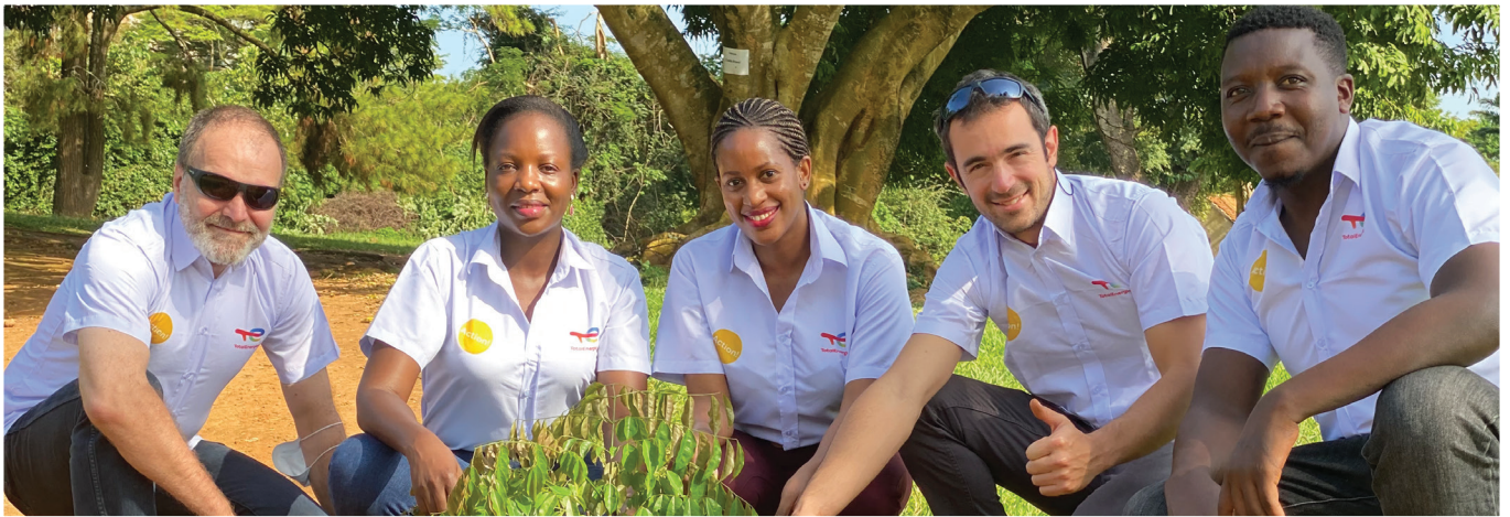
TotalEnergies EP Uganda staff pose during the ROOTs initiative event held at Entebbe Botanical Gardens.

The Ministry of Water and Environment in partnership with private sector stakeholders including; Uganda Breweries Limited, Stanbic Bank Uganda, TotalEnergies EP Uganda, ATC Uganda, among others; the Development Partners, and the civil society partners embarked on an initiative to plant 1 Million Trees across the country in one day, as a show of firm commitment towards the Running out of Trees (ROOTs) Campaign whose ambition is to plant 40 Million Trees per year until 2026 for the first phase of the programme. Now in its third year, with over 25 million Trees grown to date since 2020, the ROOTs campaign brings together the public Sector, civil society and the Private Sector in concerted efforts to address a looming challenge of deforestation in the country that threatens to render Uganda more vulnerable to climate related disasters and unable to meet its wood needs by 2030, if nothing drastic is done to reverse the declining forest cover.