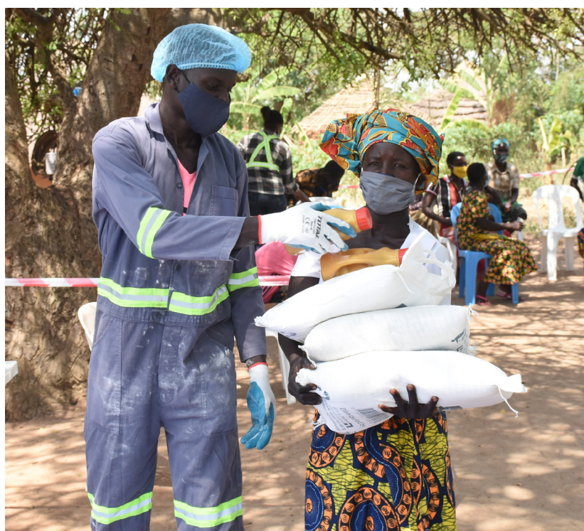
Snapshot of PAPs receiving their rations from TEPU contractor Eco & Partner.

The transitional support (Dry Rations) program for Tilenga Resettlement Action Plans (RAPs 2-5) commenced on 2 nd November, 2021 with an introduction of the program to Buliisa district leaders. The program is set to run in Buliisa, Hoima and Kikuube Districts where about 4250 households are expected to receive dry food rations for a duration of six (6) months.