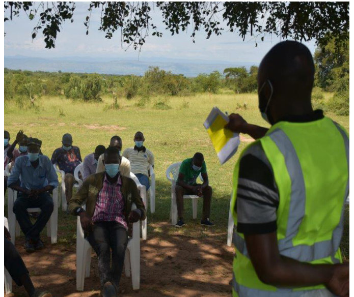
TEPU CLO (L) meets with beneficiaries of the vocational training scholarship under RAP 1 ahead of school reopening in October 2021.

The trainees were supposed to complete their training last year, but the education sector was shut down due to COVID-19.