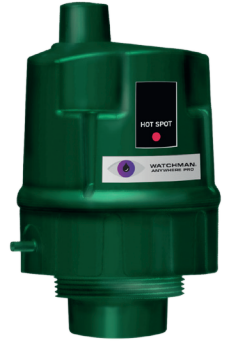
VISIOSTOCK FROM TOTAL SENSOR DEVICE

You'll receive regular updates about tank levels and usage across your business, we can update you daily or weekly and in a range of formats – from smartphone to text alerts. The choice is yours.